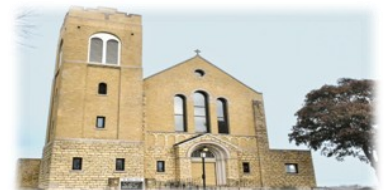
St. Mary Church (SM)

36483 County 47 Boulevard Goodhue, MN 55027