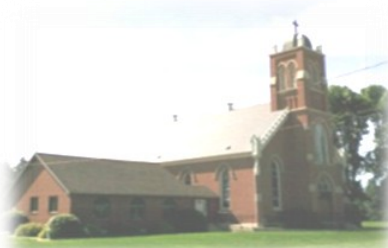
St. Columbkille Church (SC) 36483 County 47 Boulevard Goodhue, MN 55027