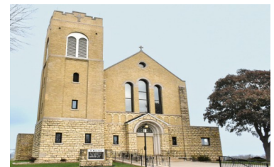
St. Mary Church (SM) 221 Chester Avenue Bellechester, MN 55027