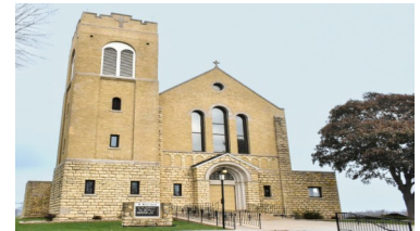
St. Mary Church (SM) 221 Chester Avenue Bellechester, MN 55027