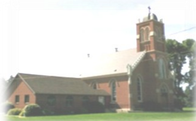
St. Columbkil Church (SC) 36483 County 47 Boulevard Goodhue, MN 55027