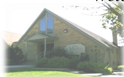
Holy Trinity Church (HT) 211 4th Street North Goodhue, MN 55027