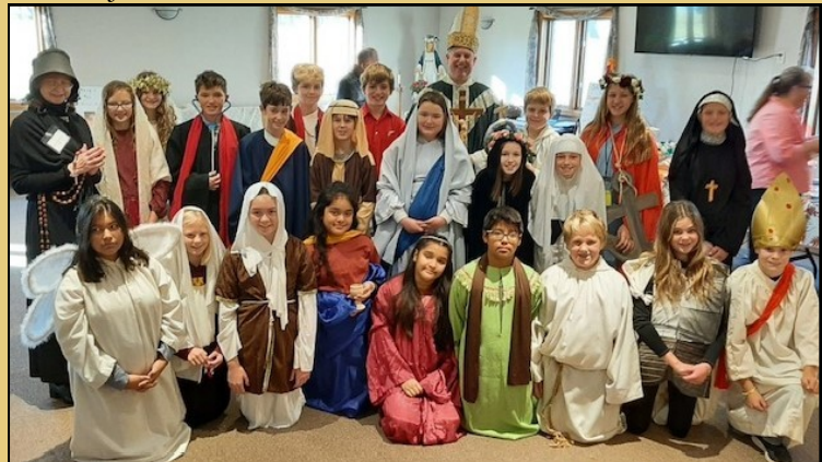
Photo from the 2022 All Saints Day Celebration

All Saint's Day Celebration Saturday, October 28, 2023 from 9:30AM - 12:30PM Saint presentations (10:00-11:15AM), bake sale (9:30AM-12:30PM), carnival, games, (outside, weather permitting) (10:00-12:00Noon), Special "Saint Meal" and "Angelic Treats" (9:30AM-12:30PM) Bring the whole family for fun and educational activities!