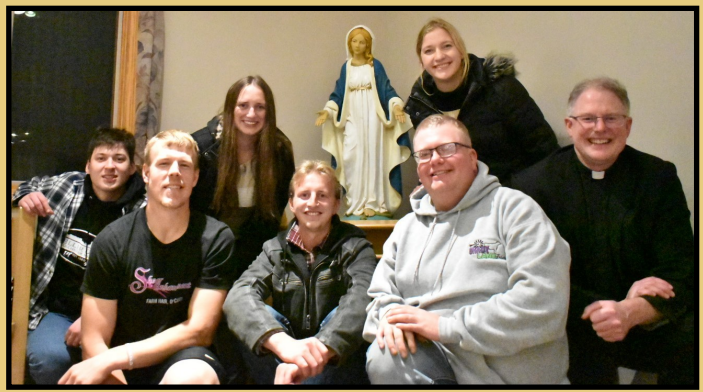
Catholic Young Adult Group met Sunday, October 15 to make sandwiches for the poor and pray the Rosary for the end of abortion.