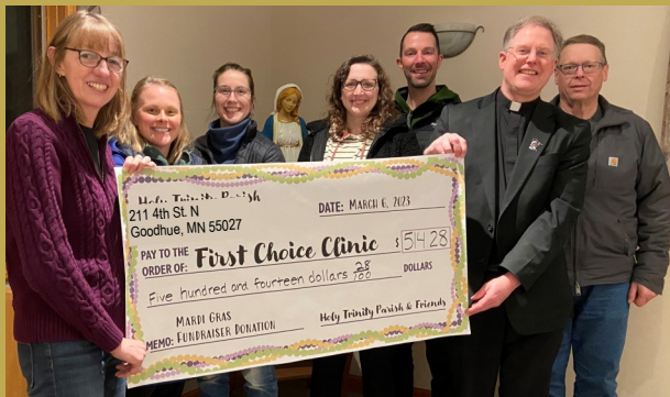
First Choice Clinic received 10% of the net Mardi Gras Fundraiser proceeds.