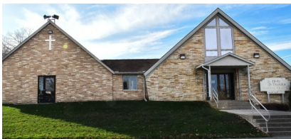
Holy Trinity Church (HT) 211 4th Street North Goodhue, MN 55027