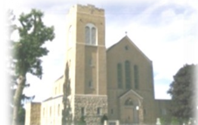
St. Mary Church (SM) 221 Chester Avenue Bellechester, MN 55027