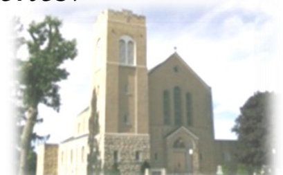
St. Mary Church 221 Chester Avenue Bellechester, MN 55027