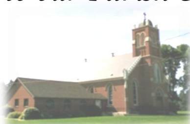
St. Columbkil Church 36483 County 47 Boulevard Goodhue, MN 55027