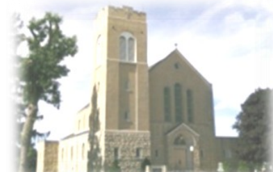
St. Mary Church (SM) 221 Chester Avenue Bellechester, MN 55027