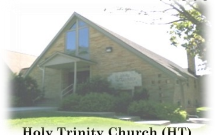
Holy Trinity Church (HT) 211 4th Street North Goodhue, MN 55027