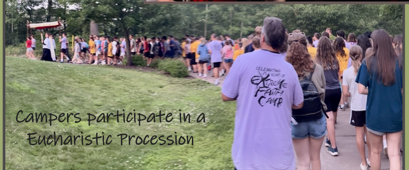
Campers participate in a Eucharistic Procession