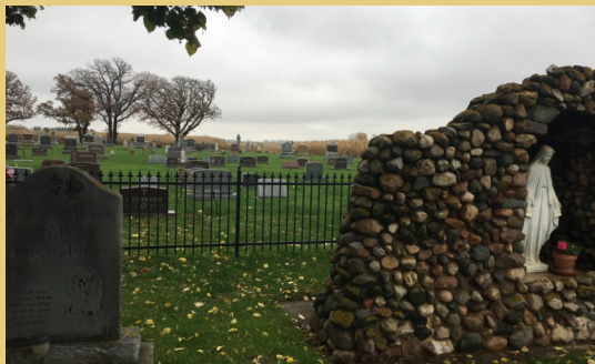
St. Columbkil Cemetery

Cemetery Collection: There will be a second collection the weekend of November 4-5 to provide for the upkeep of our parish cemeteries. Please help to maintain the beauty of the resting places of our beloved departed.