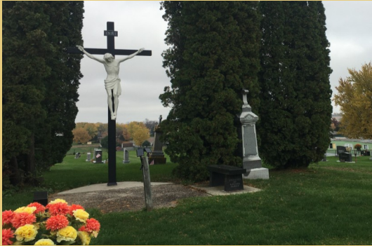
St. Mary Cemetery

Cemetery Collection: There will be a second collection the weekend of November 4-5 to provide for the upkeep of our parish cemeteries. Please help to maintain the beauty of the resting places of our beloved departed.