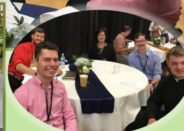
Synod participants from around the Archdiocese of St. Paul/Minneapolis.