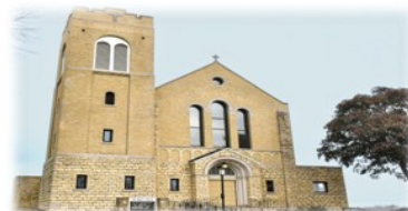
St. Mary Church (SM) 221 Chester Avenue Bellechester, MN 55027