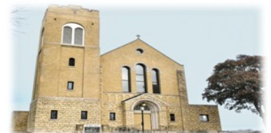
St. Mary Church (SM) 221 Chester Avenue Bellechester, MN 55027