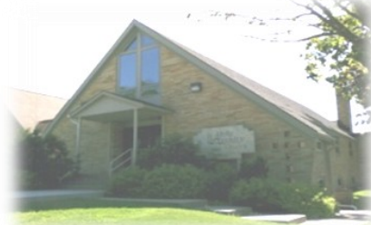
Holy Trinity Church (HT) 211 4th Street North Goodhue, MN 55027