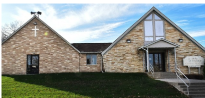
Holy Trinity Church (HT) 211 4th Street North Goodhue, MN 55027