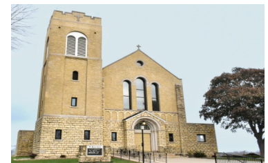
St. Mary Church (SM) 221 Chester Avenue Bellechester, MN 55027