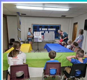
Photos from our 2024 Vacation Bible Camp

9:00-1:00 PM on July 31 (11:30 AM Mass and lunch afterward)