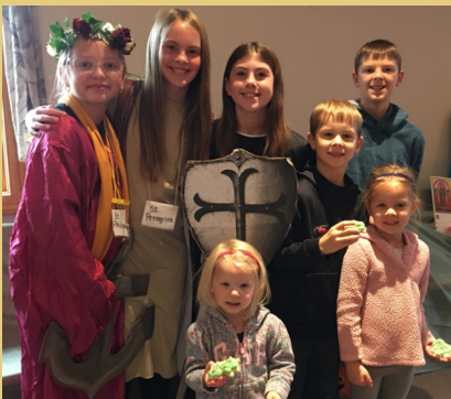
Thanks to all who organized, visited with our students and participated in this great event for the glory of God and his saintly people!