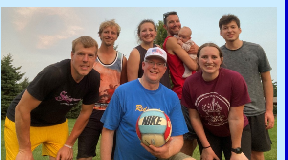
Catholic Young Adult group volleyball, picnic and Rosary at Rosie's Park, Sunday, August 20, 2023.