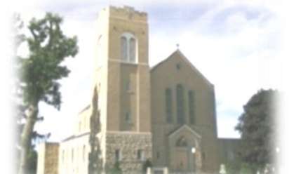
St. Mary Church (SM) 221 Chester Avenue Bellechester, MN 55027