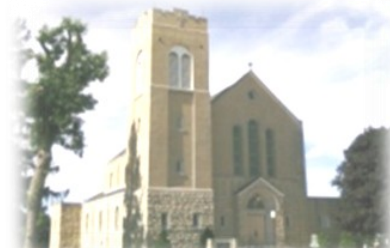
St. Mary Church (SM) 221 Chester Avenue Bellechester, MN 55027