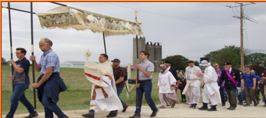
Zumbrota to Pine Island Eucharistic Procession held Friday, May 31