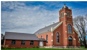
St. Columbkille Church (SC) 36483 County 47 Boulevard Goodhue, MN 55027