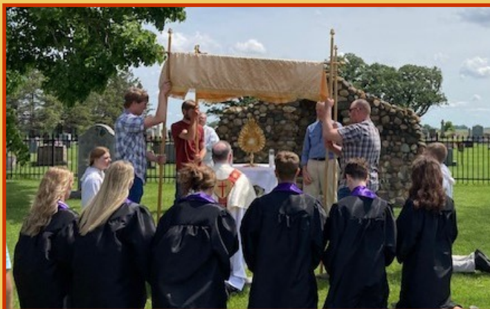
Eucharistic Procession held after Mass at St. Columbkil on Sunday, June 2