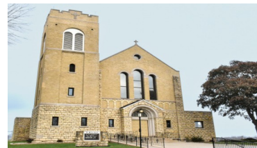
St. Mary Church (SM) 221 Chester Avenue Bellechester, MN 55027