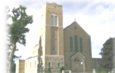
St. Mary Church (SM) 221 Chester Avenue Bellechester, MN 55027