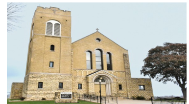
St. Mary Church (SM) 221 Chester Avenue Bellechester, MN 55027