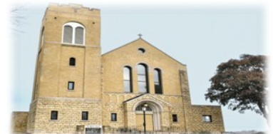
St. Mary Church (SM) 221 Chester Avenue Bellechester, MN 55027