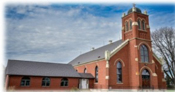
St. Columbkille Church (SC)

36483 County 47 Boulevard Goodhue, MN 55027