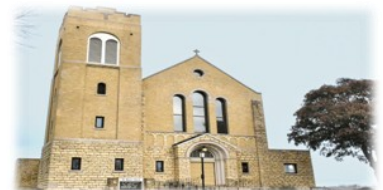
St. Mary Church (SM) 221 Chester Avenue Bellechester, MN 55027