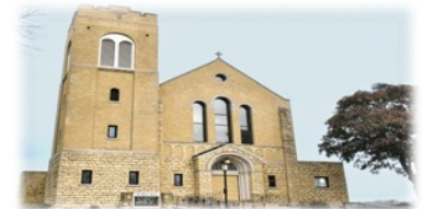
St. Mary Church (SM) 221 Chester Avenue Bellechester, MN 55027