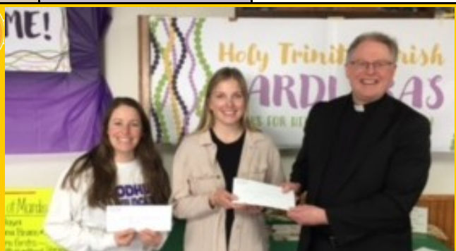
Some winners at the HT Parish Mardi Gras Accelerated Corn Hole Toss competition, 2026.

We grossed $3,910.00, but need to figure out expenses, and collect some silent auction money. Thank you for your generous support!!